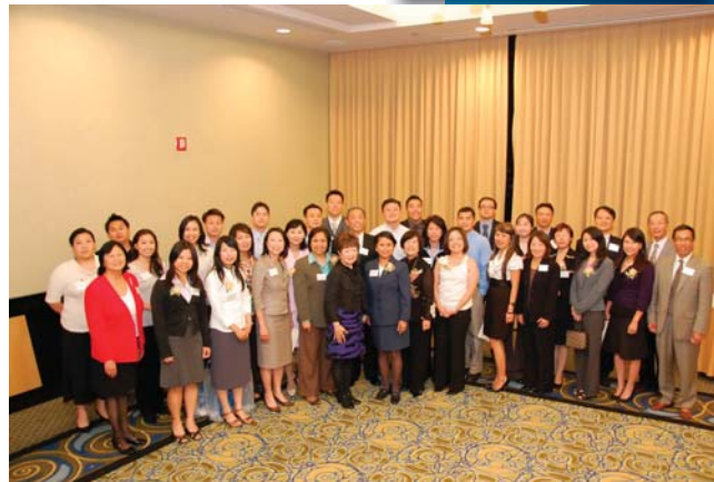
AAPA's 2009 Graduating Mentee Class and Executive Mentors