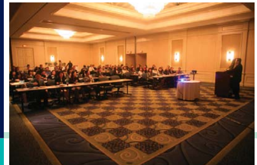
AAPA Workshop Presentation